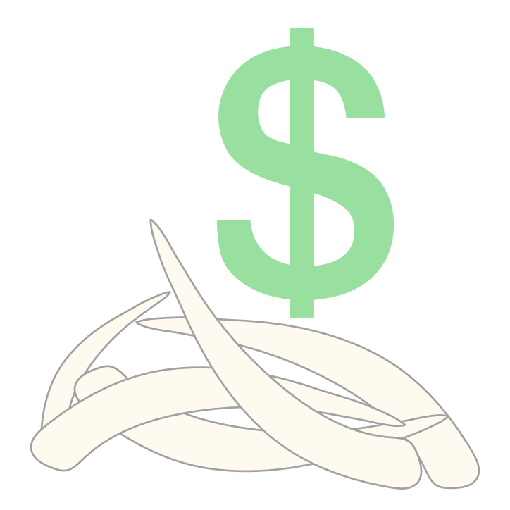
Nearly 250 pounds of elephant tusks are poached every few days. The ivory tusks are worth $1,500 per pound