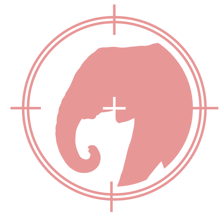
Approximately 30,000 African Elephants are killed per year.